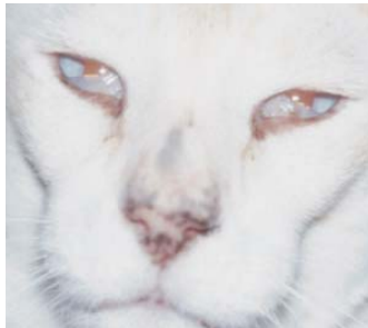
A cat with painful eyes and the third eyelids up.